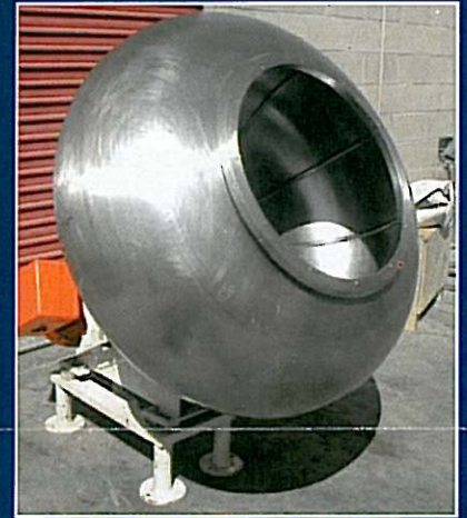
46" STAINLESS STEEL COATING PAN