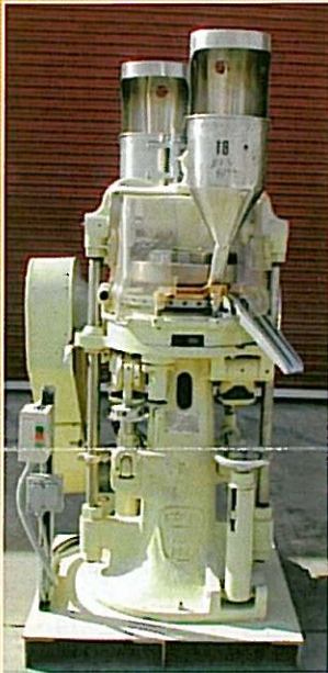
ONE STOKES MODEL 900-513 (BB2) TABLET PRESS