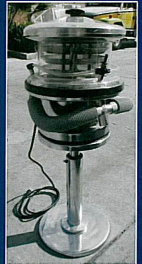
ACTA DEDUSTER, MODEL #TD2200