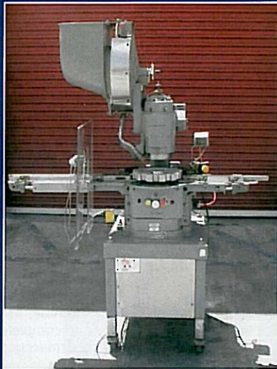
WEST COMPANY CAPPER MODEL PW525F