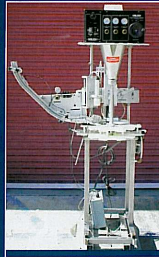
KALISH CAPPER MODEL 5130