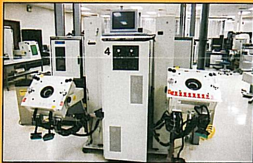
(2) 2 SCHLUMBERGER Sentry 21/60 Logic Testers, hi speed/low volt dual heads, 60 pins, ELM and MPMU options