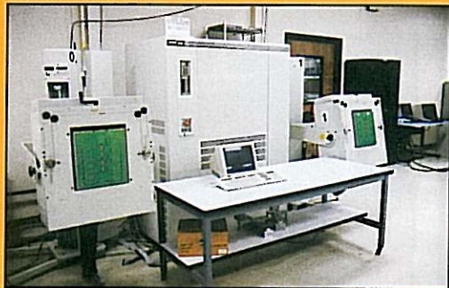
SCHLUMBERGER Sentry S90 Memory Tester, dual head