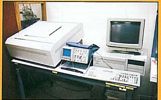
TEKTRONIX Trisys ESD Test System, with 400MHz oscilloscope, computer and video system