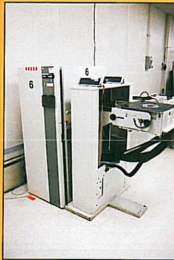
XINCOM 5588-2 and 5588-3S Memory Testers