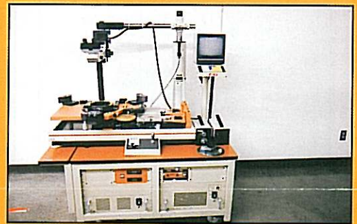
Numerous ELECTROGLAS 2001X Probers with vision systems, hot chucks and auto. load cassette to cassette