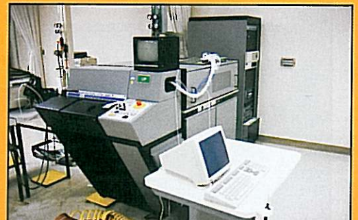
ESI 8000C Laser Processing System