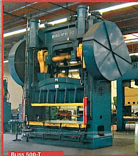
BLISS 500-T STRAIGHT SIDE PRESS

CAN'T ATTEND? REGISTER TO BID BidSpotter.com ONLINE