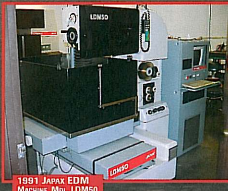
1991 JAPAX EDM MACHINE, MDL. LDM50