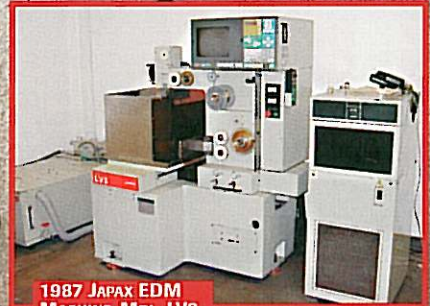
1987 JAPAX EDM MACHINE, MDL. LV3