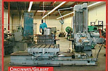
CINCINNATI/GILBERT BORING MACHINE