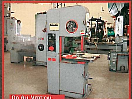
DO ALL VERTICAL BAND SAW