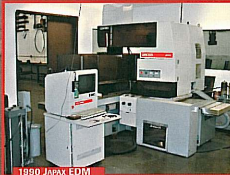
1990 JAPAX EDM MACHINE, MDL. LDM100