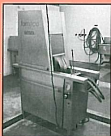
Fomaco Reiser Former Mdl. FMG2080F