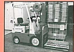
Datsun Propane Forklift, 4,000-lb., w/side shifters and triple mast reach