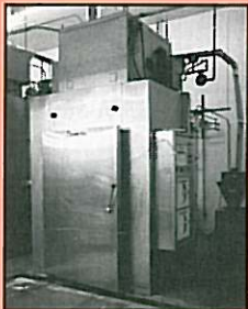
Enviro-Pak Single Truck Smoker System, with mdl. EG-VHD wood chip smoke deliverer and Micro-Pak series MP1000 controller and assorted smoking trucks

2557 Barrington Court, Hayward, California