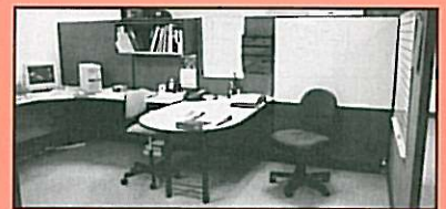
(6) Assorted Sized Modular Workstations, w/work surfaces, hanging files, overhead storage cabinets and fabric covered panels