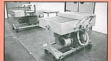
Koch Packaging Systems Mdl. 2000B Ultravac and AG800 Multivac Vacuum Sealers

PLUS!!! AT&T Merlin Plus Phone System, w/(9) handsets; Sullair Mdl. 6E Compressor, w/tank; Skyline Portable Trade Show Display.