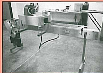
OAL Associates Heat Sealer, w/SS conveyor