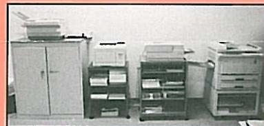
Assorted Office Equipment including Canon L700 Plain Paper Fax, HP LaserJet 4 Plus Printer, Canon NP2020 Copier and Apple LaserWriter II Printer