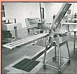
(6) Bizerba Type A330FB2 Automatic Slicers, with digital programmable controllers and conveyor feeds