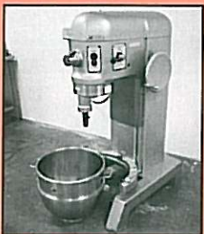
Hobart 60 Qt. Mixer Mdl. H-600, w/mixing paddle and (2) mixing bowls

A 10% BUYER'S PREMIUM WILL APPLY TO ALL PURCHASES