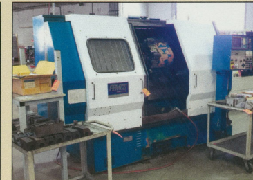
FEMCO Turning Center, Mdl. WNCL-35/70