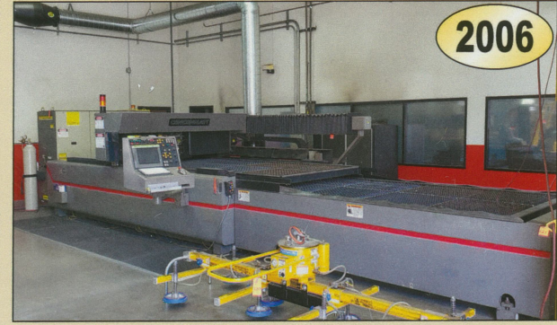
CINCINNATI CNC Laser, Mdl. CL-6 2500W (5x10)