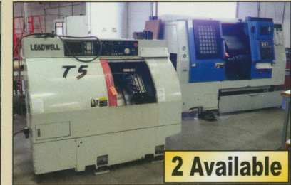
LEADWELL CNC Turning Centers, Mdl's. LTC-20SM & T5

Log into www.assetreliance.hibid.com to view all assets up for auction and to register as a bidder. ONLINE BIDDING ONLY!