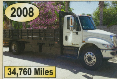
INTERNATIONAL Durastar Flatbed Diesel Truck