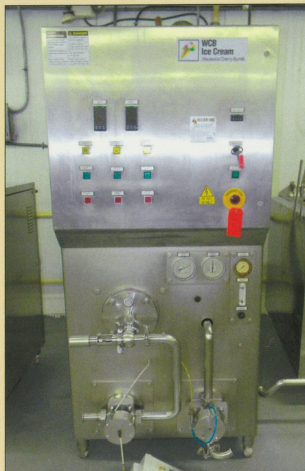
Cherry Burrell WCB C5800-2P Batch Machine

Log into www.assetreliance.hibid.com to view assets for sale, register and bid at the sale. ONLINE BIDDING ONLY!