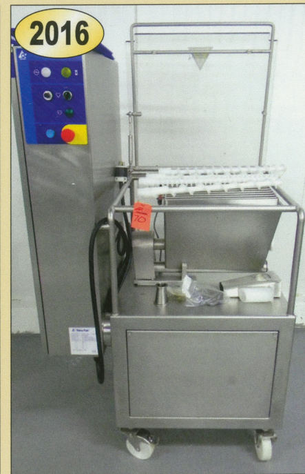
Tetra Pak A2000M2 Fruit Filler/Ingredient Doser